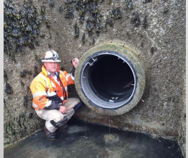
New tide gate installation