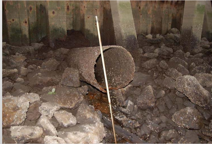
Ponded water in the pipes