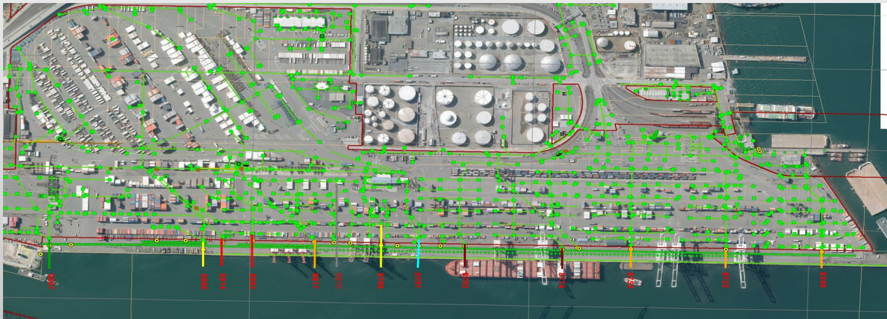
East Waterway Outfall Locations