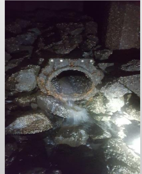
Missing tide gates